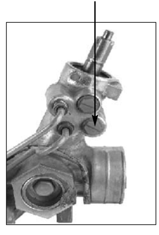
Type 3 For part numbers: 22-217, 22-234, 22-237, 22-264, 22-271, 22-272, 22-283