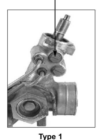
For part numbers: 22-214, 22-219, 22-228, 22-230, 22-231, 22-235, 22-239, 22-241, 22-242, 22-243, 22-244, 22-246.

22-243, 22-244, 22-246, 22-250, 22-251, 22-252, 22-253, 22-268, 22-276